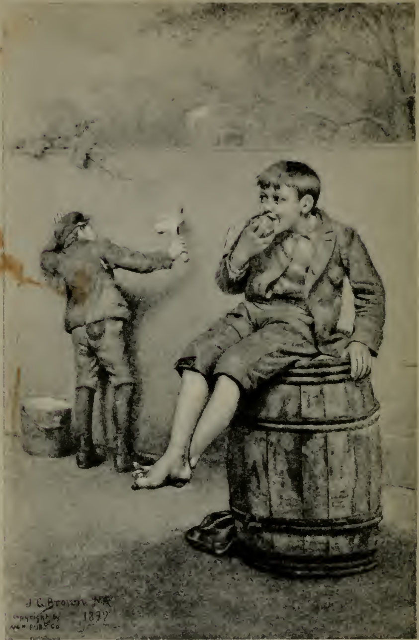
"Does a Boy Get a Chance to Whitewash a Fence Every Day?"